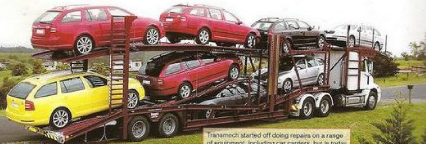
Transmech started off doing repairs on a range of equipment, including car carriers, but is today renowned as a specialist builder of car carriers.

under the safe working height maximum of 1.5 metres and eliminating the need for safety railings. The whole deck also lowers to provide a level loading platform, a feature that