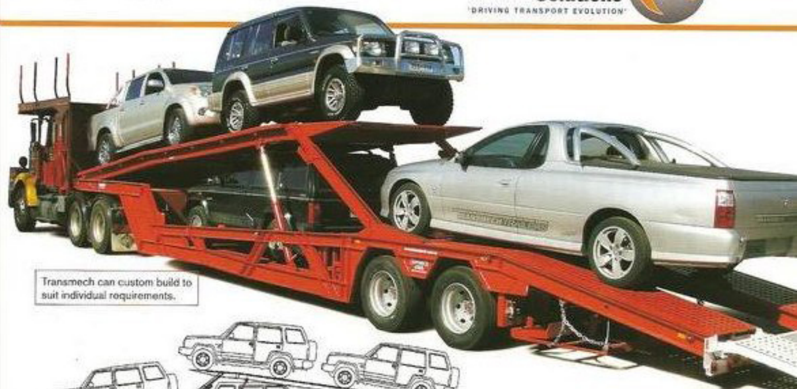
Transmech can custom build to suit individual requirements.